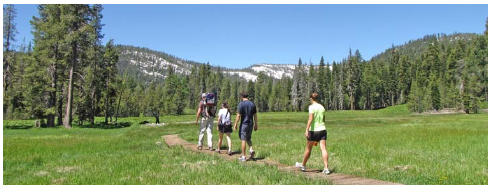
Hikers pass through upper Drakesbad Meadow

Black bears have been sighted frequently in the Warner Valley area. Avoid potential bear encounters on the trail by making noise to make your presence known. Be particularly careful near streams, and when vegetation or terrain limits visibility. If you encounter a bear, do not run. Slowly back away or detour around the bear if it is not aware of you. Report any bear encounters to a park ranger.