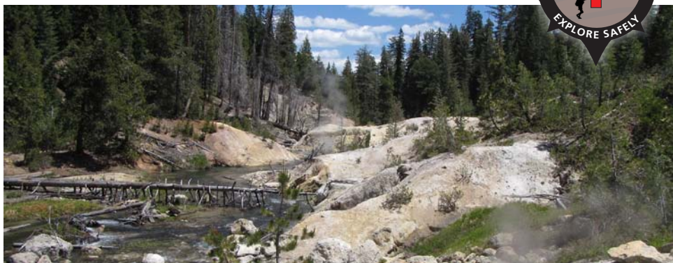
Steam rises over Hot Springs Creek